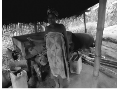
Figure 1. A female distiller supervising the ‘cooking’ of palm wine, near Ig-bòbì.

process of distillation either because the tubing was not clean or because the plastic leached when in contact with highly potent alcohol. Non-copper metal conduit pipes used to convey the distilling vapor into the water that eventually turns to Ògógóró has been proven to have some strong acidic transfer into the Ògógóró. 43 In many distilleries, the environment was also unhygienic. 44