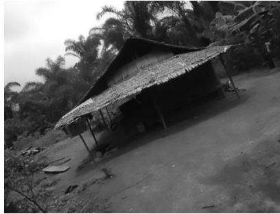
Figure 3: The Factory of Mr. Mansion at Mànhintèdó.

However, as the various duties and sanctions imposed on trade spirit continue to bite and the economy struggled, Ògógóró became more attractive, until even rich people began to depend on the poor local distillers to secure it. When the colonial government attempted to close illegal distilleries, both to uphold the law and in the interest of public health, producers were often protected and defended by local populations. When the government relied on paid informants (a system only in operation for a short time), informants often abused the system by either denouncing their enemies for personal purposes, or by lying about the location of illegal distilleries and disappearing before their lies were uncovered. 46