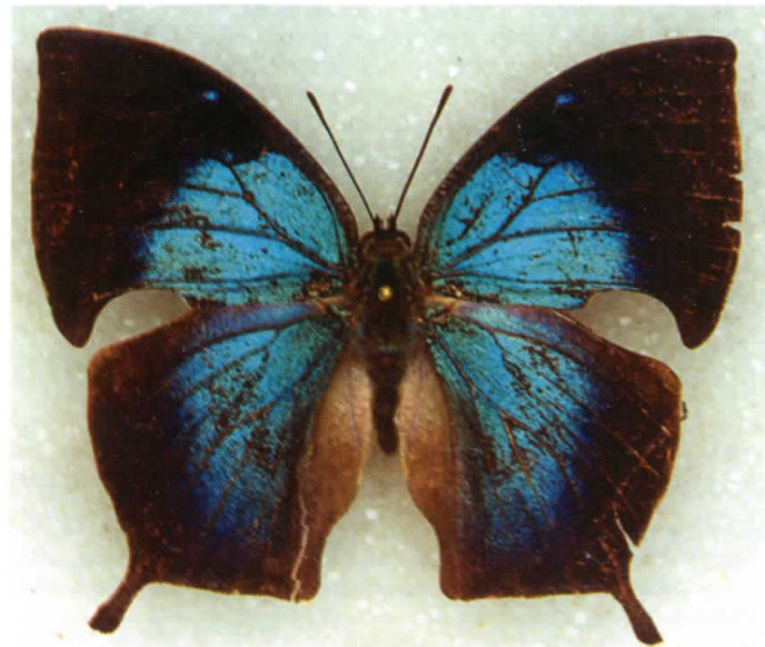
Fig. 7. Female Memphis orthesia Godman & Salvin, dorsal view. Turrialba, Costa Rica, October 1991, captured in forest edge trap with bait of rotting bananas. Author's collection. Compare with Fig. 3.

the doubts about M. aulica and its relatives by observing "it is unclear whether this species ( aulica ) is distinct from M. cleomestra ". As a final contribution to the confusion clearly reigning, an anonymous note in the corresponding specimen drawer in the Natural History Museum, London, states simply: " octavius = anassa = cleomestra = ada = aulica ". While few would probably agree with this latter position, there is clearly much work to be done to clarify and confirm distinctions between species in this particular group of Memphis spp.