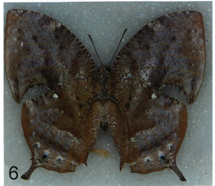
Fig. 3-6. Females of Memphis aulica Röber: 3), field-caught individual, dorsal view, forewing length 36mm. Turrialba, Costa Rica (BMNH); 4), individual reared on Croton schiedeana hostplants, dorsal view, forewing length 33 mm; larva found on understory hostplant in old secondary forest, Finca El Cerro, Florencia de San Carlos, Costa Rica, 330m.a.s.l. (Biodiversity Institute Costa Rica); 5) generalised ventral wing pattern for females of group VIII of Anaea , subgenus Memphis (Comstock, 1961; terms for pattern units follow Nijhout (1991)); 6) ventral view of same field-caught individual as Fig. 3 (forewing length 36mm).

Röber's description of Anaea anassa and its then new subspecies, aulica , is as follows: