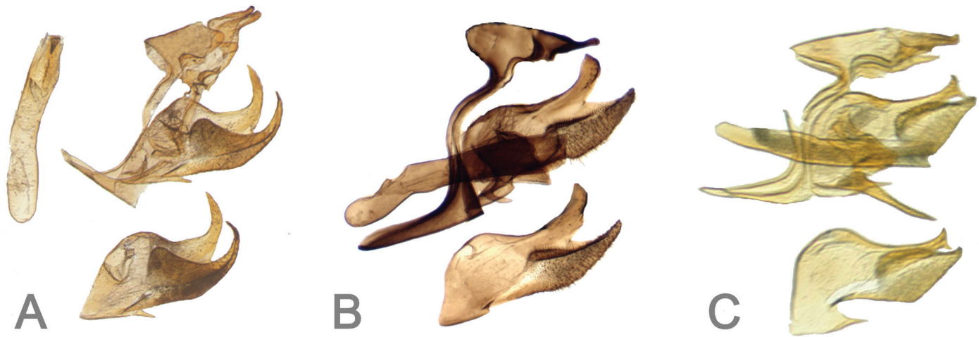
Fig. 2a. The male genitalia of three Eretis species in lateral view: A) Eretis artorius (SCC 573 ABRI: Uganda, Bwindi). B) Eretis vaga (Royal Africa Museum MRAC H.40 DRC, Paulis (now Isiro)). C) Eretis rotundimacula (1728 HEC: Zambia, High Plateau).

those of E. djaelaelae (Wallengren); the genitalia of E. artorius differ very strongly. The chief characteristic is the valve with two long, recurved processes, both ending in a point directed straight up. The valve has a poorly developed ventral/basal lobe that, as usual in the genus, ends in a sharp posteriorly-facing thorn. The uncus/tegumen is short with a small, narrow bifid tip and is without the lateral processes that are found in many species. There are just two chitinized, rounded triangles on the tegumen, which widens strongly in comparison with the narrow uncus. E. artorius has no posteriorly-pointing central process from the furca (see E. h. rotundimacula for the largest of such structures, to which Riley (1921) drew attention; the preparations are from the Hope Entomological Collections (HEC), University of Oxford Museum).