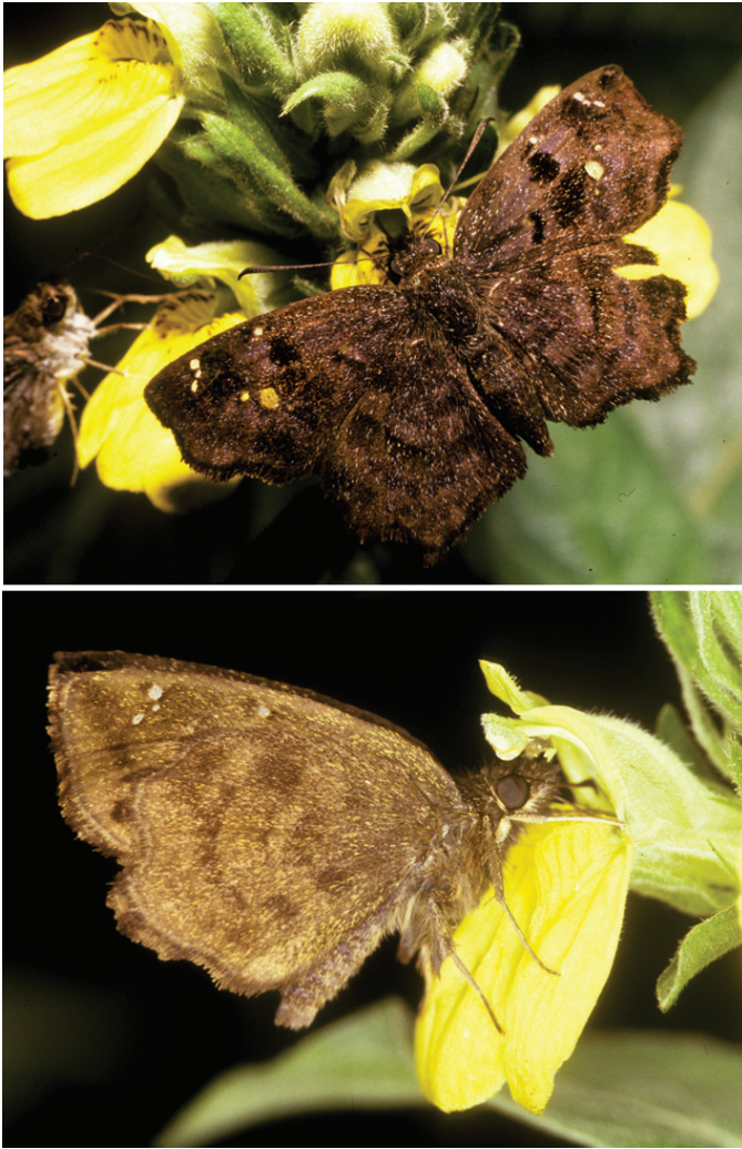
Fig. 3. Two males of Eretis artorius feeding on Justicia flava (Acanthaceae) in Kakamega Forest. It is quite unusual to see either sex sitting with the wings folded as in the picture, which fortuitously is the actual holotype.