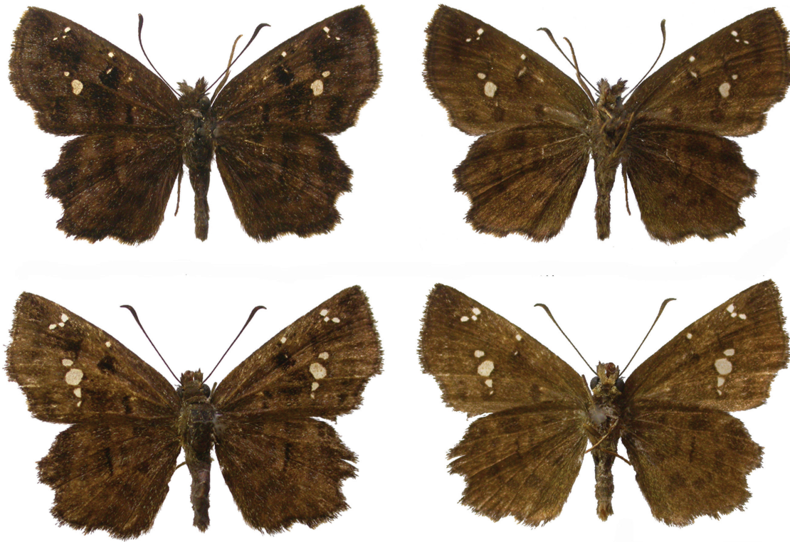
Fig. 1. Top: The holotype of Eretis artorius from Kakamega, Kenya (recto and verso); Below: A female paratype also from Kakamega (recto and verso).

the darkest upperside markings are fully visible and are mostly reduced in size.