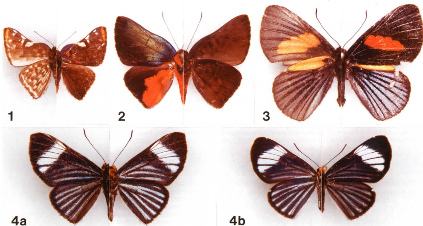
Fig. 1-4. Adults (dorsal surface on right, ventral surface on left, unless otherwise stated). 1. Symmachia praxila Westwood, male, Joinville, Brazil (USNM). 2. Symmachia satana Hall & Harvey, n. sp., holotype male, dorsal surface on left. 3. Lucillella splendida Hall & Harvey, n. sp., holotype male. 4. Esthemopsis talamanca Hall & Harvey, n. sp., a) holotype male, dorsal surface on left; b) allotype female.

five species in this group, S. fassli , S. fulvicauda , S. stigmossissima , S. virgatula and S. virgaurea are known to us to perch on the sides of tree trunks (Brévignon and Gallard, 1998; Hall and Willmott, unpubl. data; A. Neild, pers. comm.), suggesting this behavior, not exhibited elsewhere in the Symmachiini, may occur in all members of the group. All of the aforementioned species have quite distinctive wing patterns and male genitalic cornuti, which have a basic ground-plan of two rows of parallel anteriorly projecting spines. Symmachia satana is similar only to S. hippodice Godman, but the dorsal orange patterning is different and the forewing possesses a green iridescence not present elsewhere in the tribe. While the left-hand row of cornutal spines is typically attached to a sclerotized bar in most species of the group, both rows are "free-standing" in S. satana , and the lower valve process is more posteriorly elongate and bulbous.