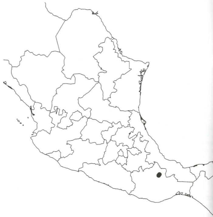
Fig. 4. Map illustrating known collection localities for A. erymanthis esperanza in eastern Mexico.

Types. — Holotype female: MEXICO.— Oaxaca : Santiago Comaltepec, La Esperanza, Sierra de Juárez, 17°37'45"N, 96°22'5"W, 1600m, Sep 1976 (A. Díaz Francés) — CNIN LEP 066691; in the CNIN.