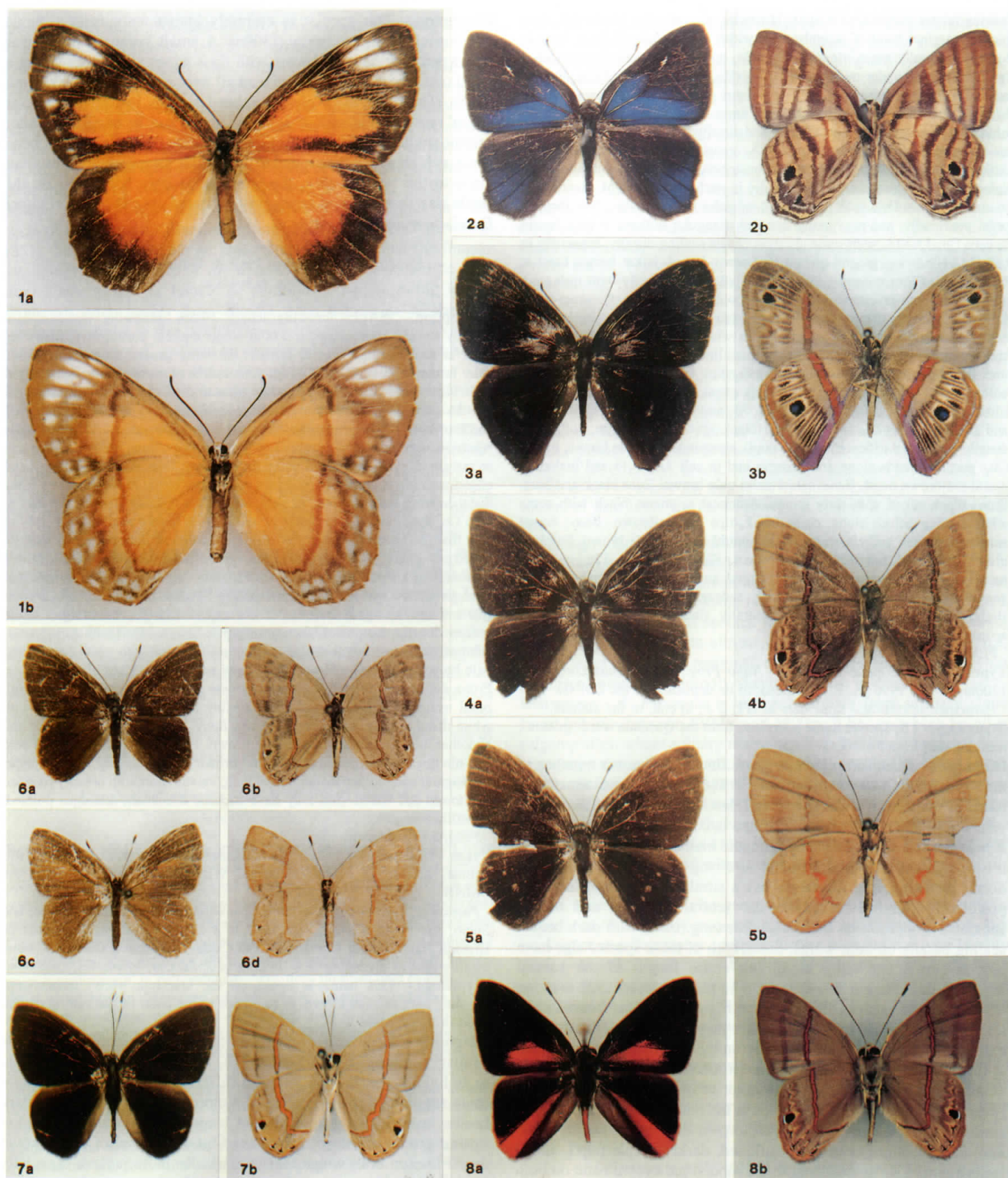
Fig. 1-8. 1. Euselasia palla Hall & Willmott n. sp., holotype female: a) dorsal surface; b) ventral surface. 2. Euselasia thaumata Hall & Willmott n. sp., holotype male: a) dorsal surface; b) ventral surface. 3. Euselasia pillaca Hall & Willmott n. sp., holotype male: a) dorsal surface; b) ventral surface. 4. Euselasia mapatayna Hall & Willmott n. sp., holotype male: a) dorsal surface; b) ventral surface. 5. Euselasia nauca Hall & Willmott n. sp., holotype male: a) dorsal surface; b) ventral surface. 6. Euselasia jigginsi Hall & Willmott n. sp., holotype male: a) dorsal surface; b) ventral surface. Allotype female: c) dorsal surface; d) ventral surface. 7. Euselasia cyanofusa Hall & Willmott n. sp., holotype male: a) dorsal surface; b) ventral surface. 8. Euselasia hieronymi bianala Hall & Willmott n. ssp., holotype male: a) dorsal surface; b) ventral surface.