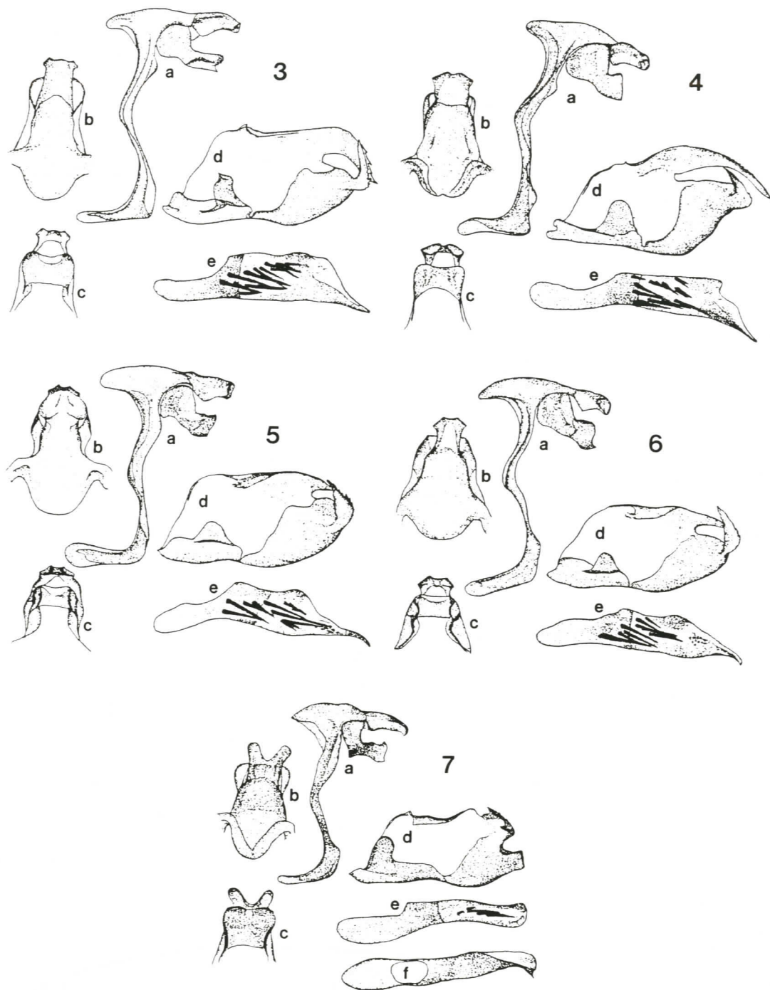
Fig. 3-7. Male genitalia of Drephalys (all from BRAZIL: Rondônia; vic. Cacaupândia, unless noted): 3) D. oriander (GTA #3823) - (a) lateral view of tegumen, uncus, gnathos, vinculum, and saccus; (b) dorsal view of tegumen, uncus, and gnathos; (c) ventral view of uncus and gnathos; (d) interior view of right valva; (e) lateral view of penis. 4) D. dumeril (GTA #4892) - GUAT: Petén; Parque Nacional Tikal, same structures as Fig. 3. 5) D. croceus (GTA #3384) - same structures as Fig. 3. 6) D. tortus (GTA #2131) - same structures as Fig. 3. 7) D. alcmon (GTA #4209) - same structures as Fig. 3 plus (f) dorsal view of penis.