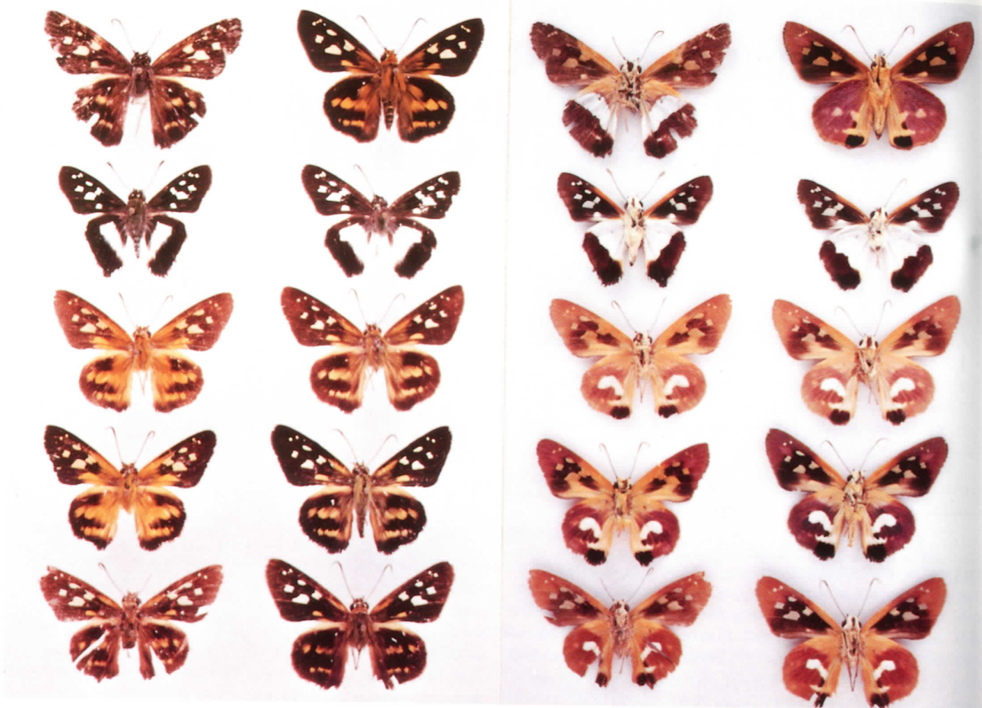
Fig. 1. Drephalys , dorsal surface (left two columns), ventral surface (right two columns), all from BRAZIL: Rondônia, vic. Cacaulândia, unless noted. Left to right each column: COLUMN 1-2.— Top row: D. phoenice - female, 27 Sep 94; D. oriander - male, 15 Aug 93. Second row: D. alcmon - male, 12 Jun 93; D. alcmon - female, 8 Oct 93. Third row: D. croceus - holotype male; D. croceus - paratype female, 24 Apr 92. Fourth row: D. tortus - holotype male; D. tortus - paratype female, 14 Nov 94. Bottom row: D. dumeril - male, GUAT: Petén; Parque Nacional Tikal, 27 Feb 92; D. dumeril - female, GUAT: Petén; Parque Nacional Tikal, 3 Feb 92. COLUMN 3-4.— Same sequence as in columns 1-2.

vague yellow scaling in M_1 - M_3 to distal edge of macule in Rs - M_1 ; costa pale yellow; fringes of both wings brown proximad, paler gray-brown distad.