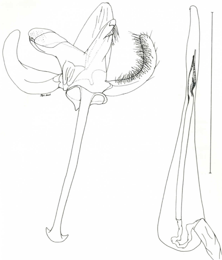
Fig. 2. Heliodines galapagoensis n. sp., holotype ♂ genitalia, plus detail of aedeagus (slide JBH 2025) (scale line = 1mm).