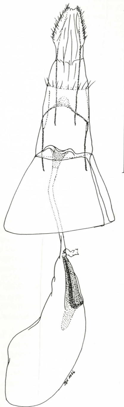
Fig. 3. Heliodines galapagoensis n. sp., allotype ♀ genitalia (slide JBH 2026) (scale line = 1mm).

FEMALE (Fig. 1).— Maculation similar to male but with a pale yellow mark near forewing base and with wing base darker fuscous; hindwings somewhat more orange dorsally. Female genitalia (Fig. 3): ovipositor simple, elongated, with setal ring far posterior to antrum area; papilla