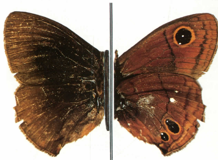
Fig. 1. Upper surface (left) and under surface (right), Calisto tasajera male, Valle de Bao (1800 m), north slope of Pico Duarte, Santiago Province, Dominican Republic.

Gonzalez, Schwartz and Wetherbee (1991) described C. tasajera from a series of specimens from San Juan Province, Dominican Republic, taken on Loma de Tasajera in fire-charred grassland at 2141m. They also reported the species from the base of Loma la Diferencia, 1750-2300m on the border with Santiago Province and from Santiago Province on Pico Platico, 1200-2500m. These localities are not accessible by vehicular traffic. Specimens reported in the present paper were obtained while the