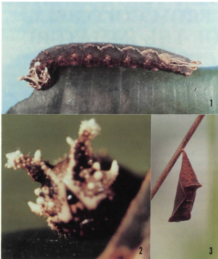
Fig. 1-3. Larval morphology of Haetera piera : 1. Fourth instar larva (Puerto Nariño, Amazonas, Colombia); 2. Head capsule (frontal view) of same larva; 3. Pupa (dorso-lateral view).

different fresh leaf cuttings of several plant species in order to determine the host range of H. piera . These plants included Spathiphyllum , Philodendron and Dieffenbachia (Araceae), Heliconia (Heliconiaceae), Calathea (Marantaceae), Welfia (Arecaceae) and two undetermined grasses (Poaceae).