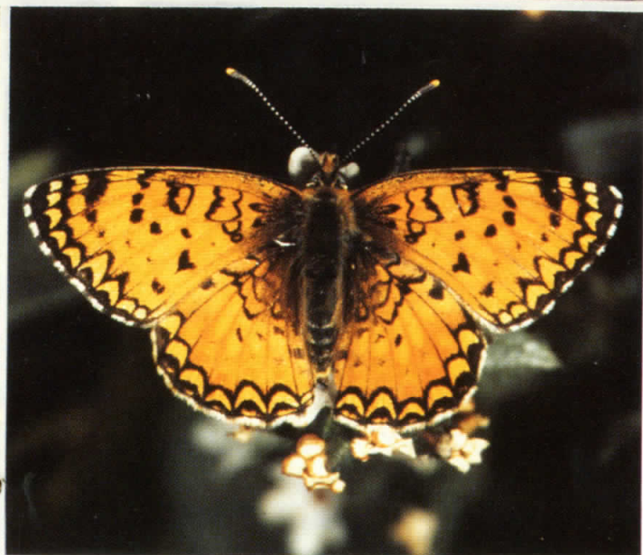
Fig. 7. Pandoriana pandora , ♀ Fig. 8. Pandoriana pandora , ♂