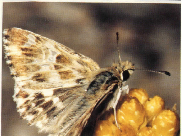
Fig. 25. Aricia cramera , ♀ ovipositing Fig. 26. Aricia cramera , ♀