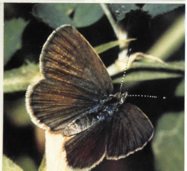
Fig. 13. Euphydryas desfontainii Fig. 14. Azanus jesous