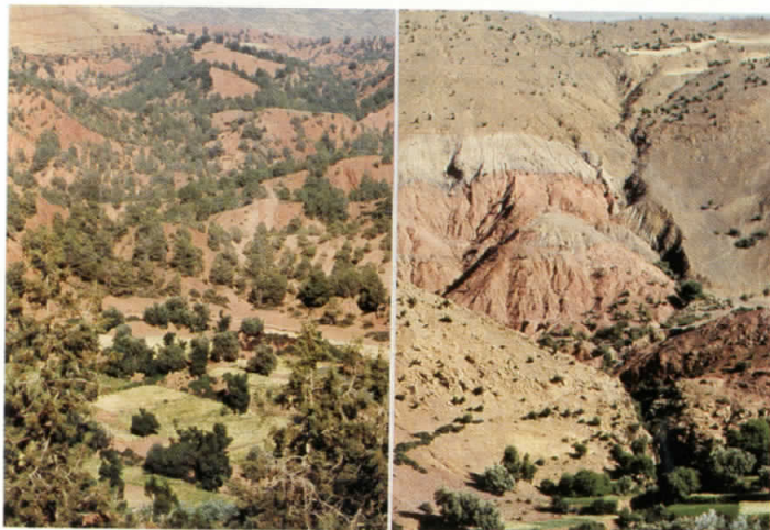
Fig. 31-32. High Atlas foothill habitats.

In conclusion, I would like to say that safety should be a concern to an entomologist travelling in Morocco. While the nomadic tribes (Bedouines and Berbers) in the desert and mountains far from civilization are friendly people (be sure to have a large supply of coins, if you want to photograph children; without reward, they may become aggressive!), crime is flourishing in the cities. The most professional, highly trained criminals