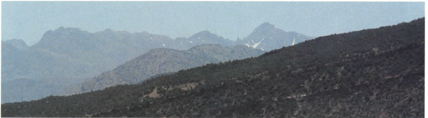
Fig. A. High Atlas, view of Masif Asni, Morocco.

KEY WORDS: Anthocharis , Aricia , Autographa , Azanus , Carcharodes , Coenonympha , Colotis , Cupido , Euchloe , Euphydryas , Glaucopsyche , Gonepteryx , Hesperidae, High Atlas, hostplants, Hyponephele , Lepidoptera, Lycaenidae, Lysandra , Melanargia , Melitaea , Middle Atlas, Nordmannia , Nymphalidae, Pandoriana , Papilionidae, Philotes , Pieridae, Plebicula , Pseudochazara , Pyrgus , Tarucus , Thersamonia , Zegris , Zerynthia , Zizeeria .