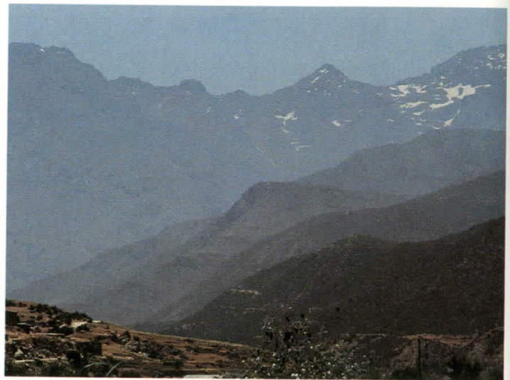
Fig. 33. Jebel Torbkal, Masif Asni, High Atlas.

wait for a tourist immediately inside or in front of his hotel. They usually work as a team of two men, one on a motorcycle who will help to carry away the successful pickpocket. Try to avoid any people, especially on trains and buses, who will try, very politely but adamantly, to involve you in a conversation saying that they are "students" who like to talk to foreigners to train their language skills. Very soon, these "students" will ask for financial reward, because the conversation was actually a service of a "tourist guide" that provided you with a "lot of information." Or they will push you to go into a particular hostel or hotel, whose manager is "their friend," and so forth. In northern Morocco, your car may be stopped far from civilization by hashish peddlers, who want to sell hashish to you and will threaten your personal safety if you refuse. It is better not to go to Morocco alone. Two or three persons, however, may feel fairly safe on an entomological expedition and have most interesting and stimulating collecting and photography in this fascinating country.