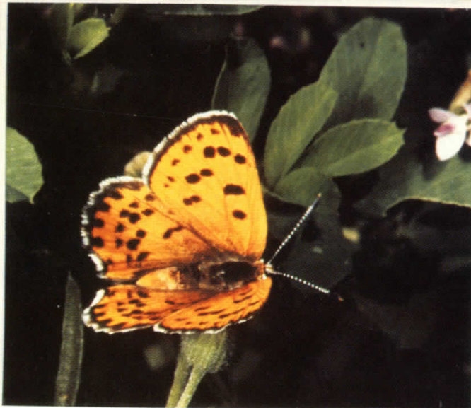
Fig. 19. Lysandra punctifera , ♂ Fig. 20. Lysandra punctifera , ♂