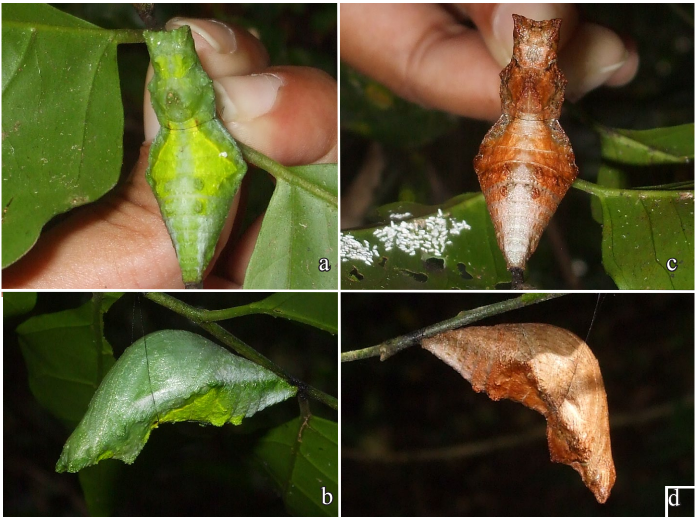
Fig. 3. Dorsal (a) and lateral (b) view of the green pupae and dorsal (c) and lateral (d) view of the brown pupae of P. schmeltzi on the M. minutum plant in the enclosure.

Copulation. Breeding studies of P. machaon bairdii (Thompson, 2003; Tkacheva et al., 2005) suggested that swallowtails do not readily pair by themselves in captivity, so hand-pairing and force-feeding is advised. However, no hand-pairing or force-feeding was needed in this study as the cage size used was adequate and the cage design was suitable for butterflies to engage in normal activities as close to those in natural habitat as possible.