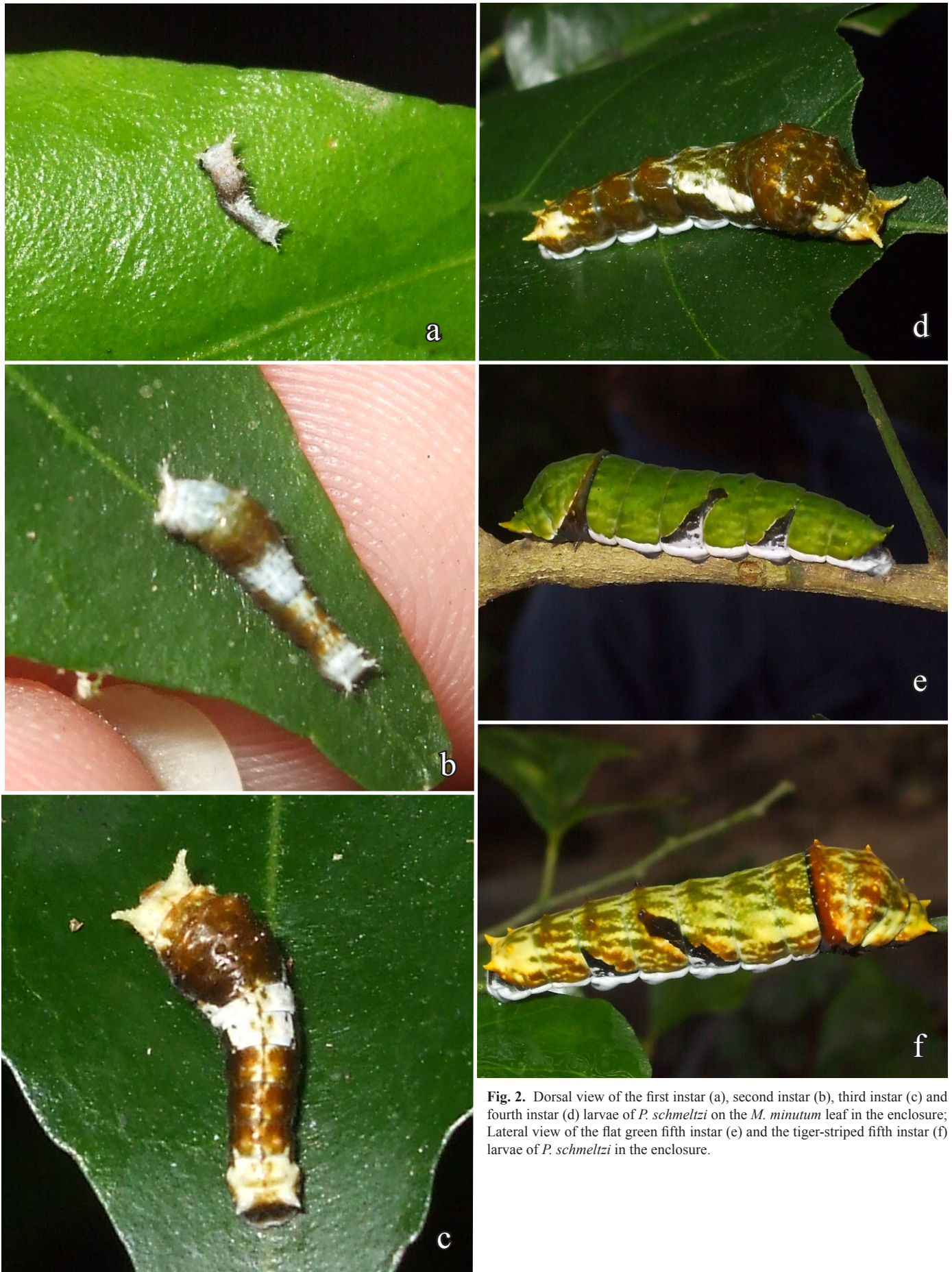
Fig. 2. Dorsal view of the first instar (a), second instar (b), third instar (c) and fourth instar (d) larvae of P. schmeltzi on the M. minutum leaf in the enclosure; Lateral view of the flat green fifth instar (e) and the tiger-striped fifth instar (f) larvae of P. schmeltzi in the enclosure.