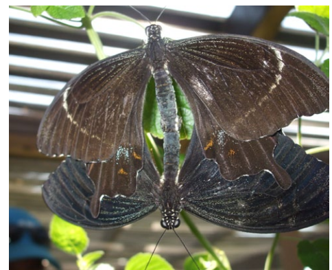
Fig. 5. Copulation of P. schmeltzi .