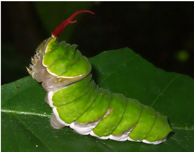
Fig. 4. Defensive posture of fifth instar larvae of P. schmeltzi in the enclosure.

high flight activity and low population density. Fertility per day of P. schmeltzi in captivity was higher than that under natural conditions as revealed by field data. The number of eggs laid on individual larval host plants ranged from 4 to 36.