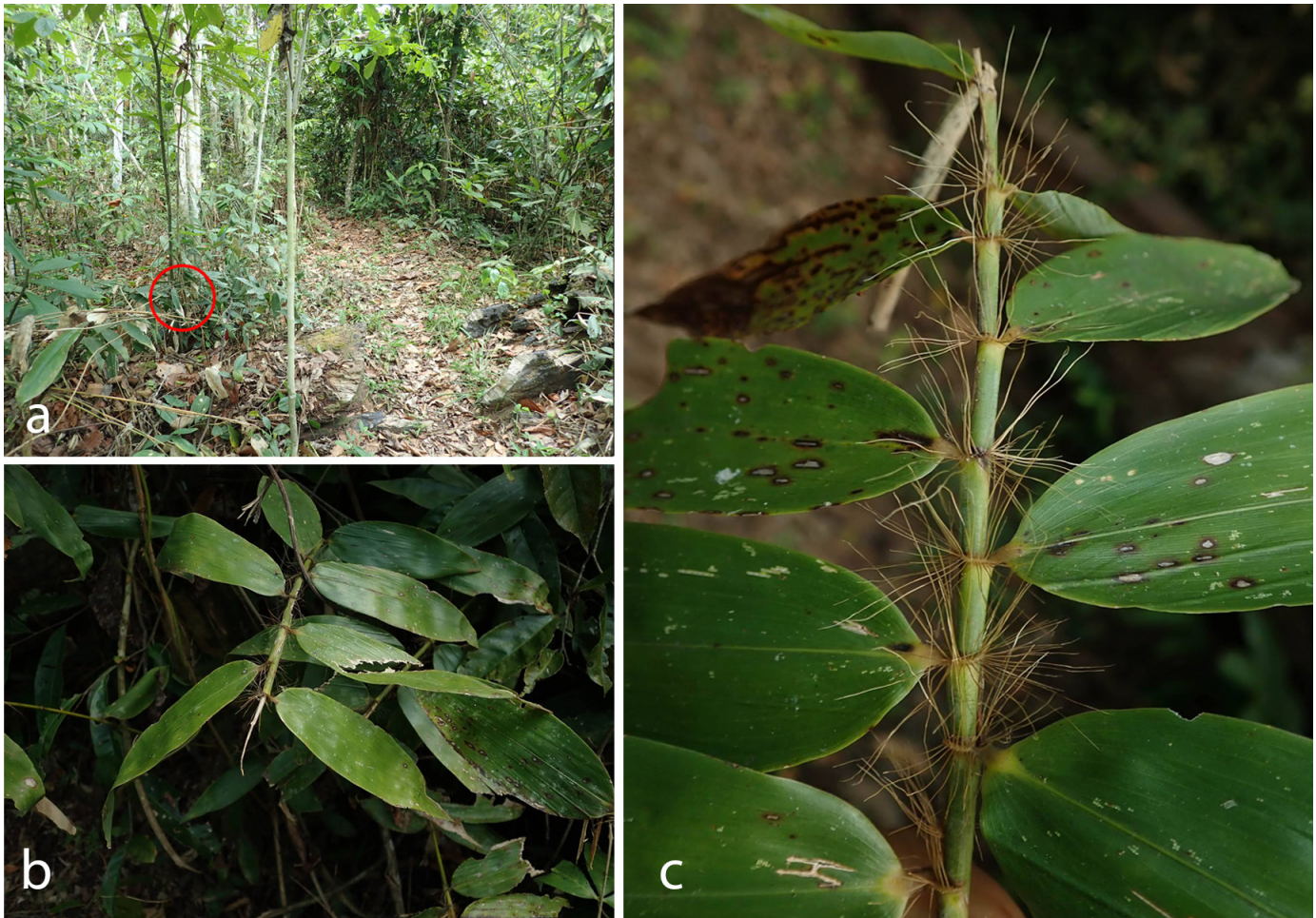
Figure 1. Habitat and the hostplant, Pariana lunata (Poaceae: Bambusoideae: Olyreae), of Chloreuptychia marica : a) general view of the habitat where the hostplant was found (location of hostplant circled in red); b) close-up view of the hostplant; c) detail of leaves and nodes.

Fourth (last) instar (Fig. 2f): Head capsule width 1.6 mm ( n=1 ; 2020_FLP_IMM_0185). Head morphologically similar to previous two instars, except somewhat darker; body creamy-white; a pair of well-defined light yellow stripes laterally (and presumably dorsally) but apparently poorly defined at both ends, well-defined dark red stripe in lateral view below this yellow stripe, as well as a few indistinct narrow whitish stripes; caudal filament virtually concolourous to that of third instar but inner area not discernible, slightly shorter than head scoli in length. Duration: 18-26 days ( n = 2 ).