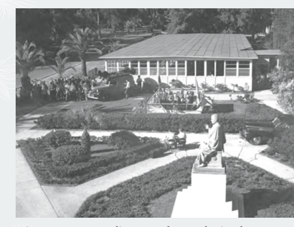
Fig.3 - Temporary reading room where garden is today