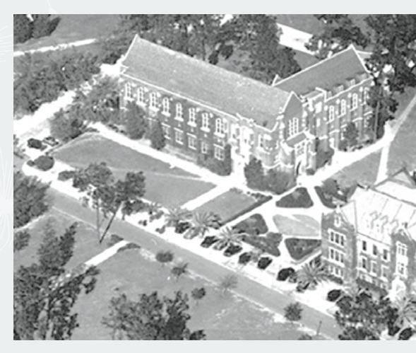
Fig.2 - Early aerial photograph of University Library and Peabody Hall - garden in upper left