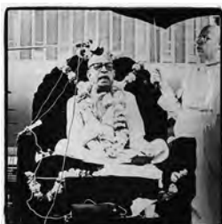
Srila Prabhupada, founder of the Hare Krishna movement also known as the International Society of Krishna Consciousness (ISKCON), speaks at the UF Plaza of the Americas in 1971. Note the Colonnade in the background

The Hare Krishnas first arrived in Gainesville in 1970, and since 1971 have served “karma-free food” at the Plaza of the Americas, while performing musical mantra meditation. They were also key funding contributors to the University’s 2019 beautification of the Plaza.