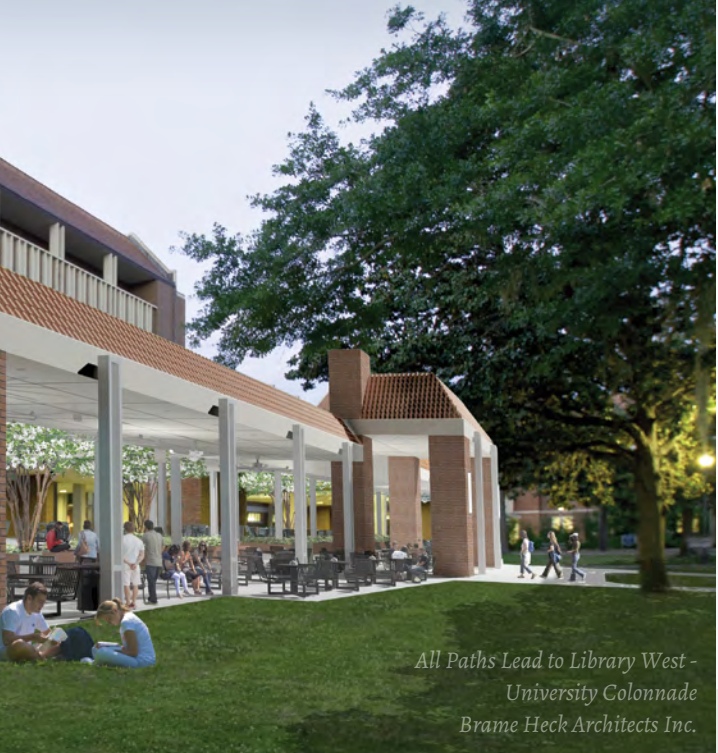
All Paths Lead to Library West - University Colonnade Brame Heck Architects Inc.