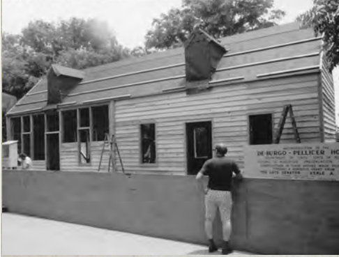
Fig. 3 The De-Burgo Pellicer House – a reconstructed British colonial era home – exemplifies the HSABP’s transformation of St. George St. during the 1960s & 1970s.