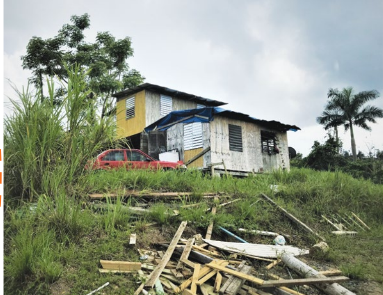
Above, stands a wooden home draped in a blue tarp. Taken at the 'Invasion Corridor' of Galateo, Toa Alta – credit: Christian Tirado