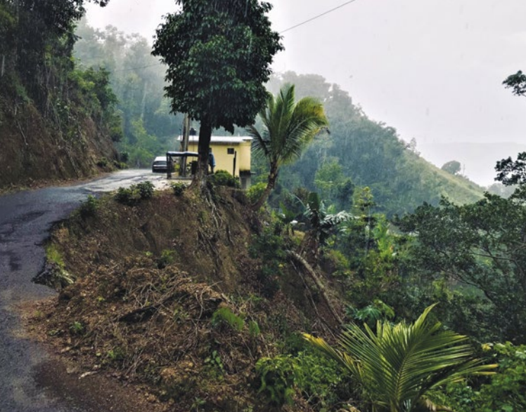
Above, stands a vulnerable home nearby a Hurricane Maria landslide. Taken at Los Quemados, Lares