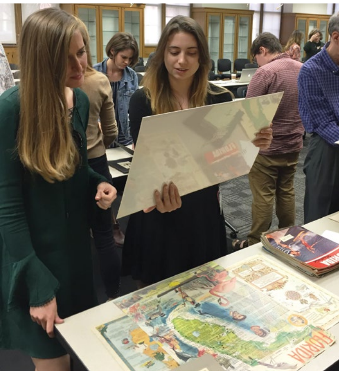
Images of Museum Studies MA or Certificate Program students enrolled in the Exhibitions Seminar

EXPERIENCES . Positive reality of F what and The partnership is mutually beneficial and signals a broader trend in cultural heritage professions and GLAM (Gallery, Library, Archive, Museum) collaboration. As emerging museum professionals, the students gain valuable experience that can help focus their career path. The Libraries benefit from the students' expertise and willingness to experiment. More often than not, these opportunities are paid assignments, which is rare in both the library and museum field.