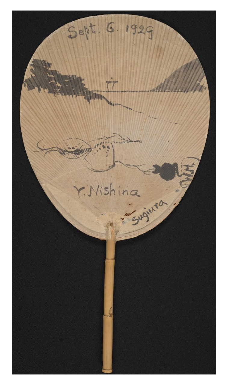
Japanese Souvenir Fan, 1929

In light of these discoveries and necessary edits in our finding aids, Special Collections & Archives staff have considered how to guide future descriptive practice in an effort to remain clear and objective regarding race and other demographic terminology. A few guidelines will be carried forward: