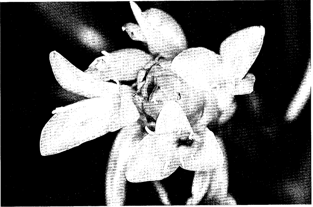
FIGURE 2. Guzmania loeflingiana, flowering in cultivation at the Marie Selby Botanical Gardens (MSBG 1992-0438).

exceeding the internodes, subdensely brown punctate-lepidote above and below, light green, slightly succulent when fresh; inflorescence simple, ellipsoid, 6–10 cm long, 2.5–3 cm diameter, slightly exceeding the leaves; floral bracts densely imbricate, obovate, succulent, lustrous when fresh, pale dull green to dull brownish green when dry, 4.5–5 cm long, apex obtuse to subacute, slightly cucullate, conspicuously exceeding the sepals, margin widely membranaceous, punctate-lepidote, nerved toward the apex when dry, lustrous green to whitish toward the base; flowers 8–9 cm long, subsessile; sepals lanceolate to oblanceolate, apex acute, 3–4.5 cm long, connate 8–9 mm, subdensely dark punctate-lepidote above and below; petal-blades whitish to white greenish or cream, lobes elliptic to obovate, ca. 7 cm long, apex acute; stamens included; capsules 3.5 cm long; seeds ca. 2 cm long, the coma light brown.