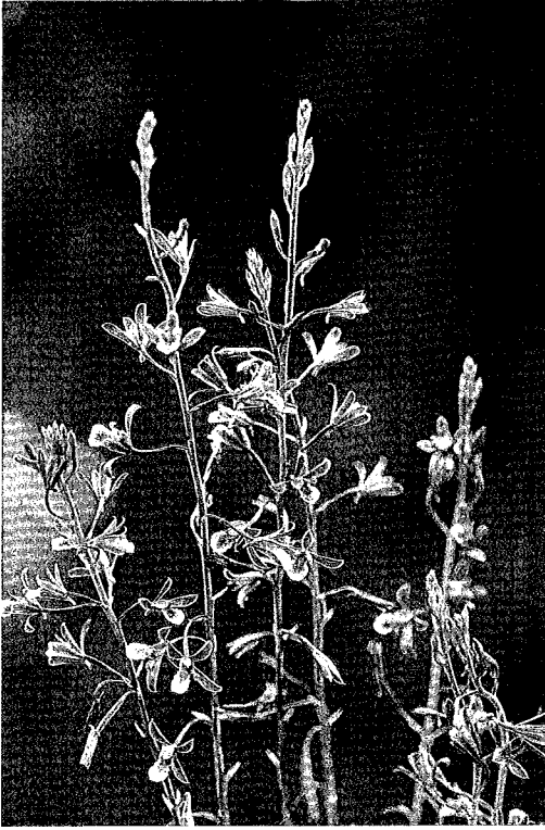
FIGURE 1. Eulophia graminea .

Eulophia graminea plants had been found. In addition, a one day survey was made along the eastern part of Palm Beach County was made in October 2010, with searches in mulched beds in supermarkets and shopping centers from Boca Raton in the southern part of the county to Palm Beach in the northern part of the county.