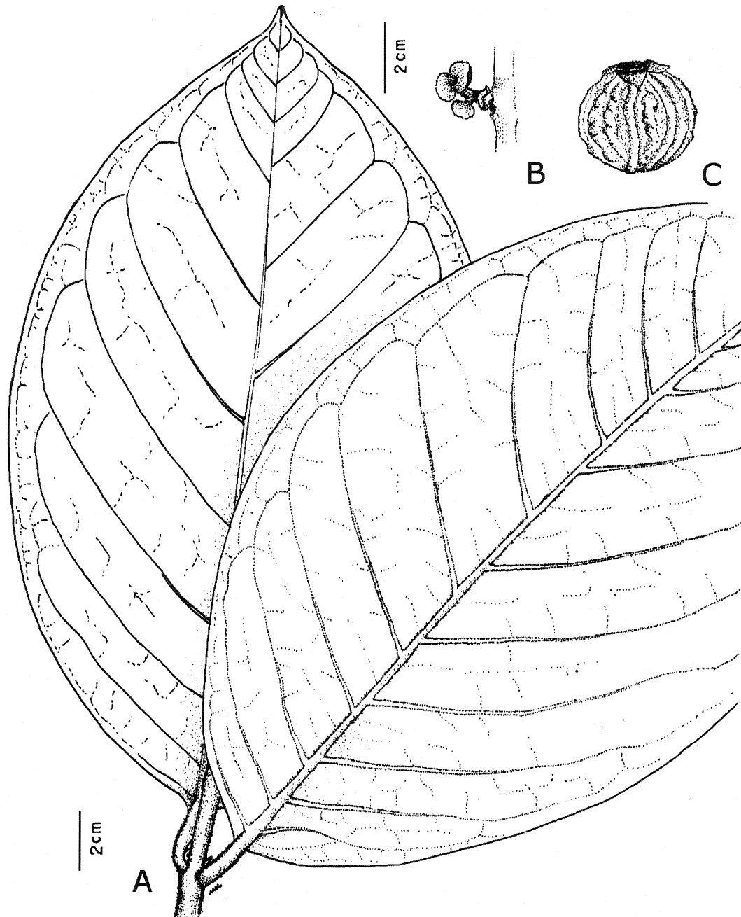
FIGURE 1. Eugenia ampla . A. Leaves. B. Old inflorescence with bracts and bracteoles. C. Fruit. (A–C: Øllgaard et al. 57051).

ochraceous-tomentose on the lower surface, the reduced racemes, and the costate-verrucose fruits. It is known only from collections in rain forests of the Parque Nacional Yasuní, at 260–350 m elevation. Eugenia marowynensis Miq., a species known from Suriname, French Guiana,