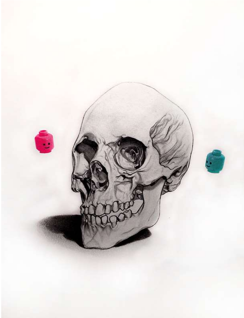
Entropy. Graphite/mixed media.