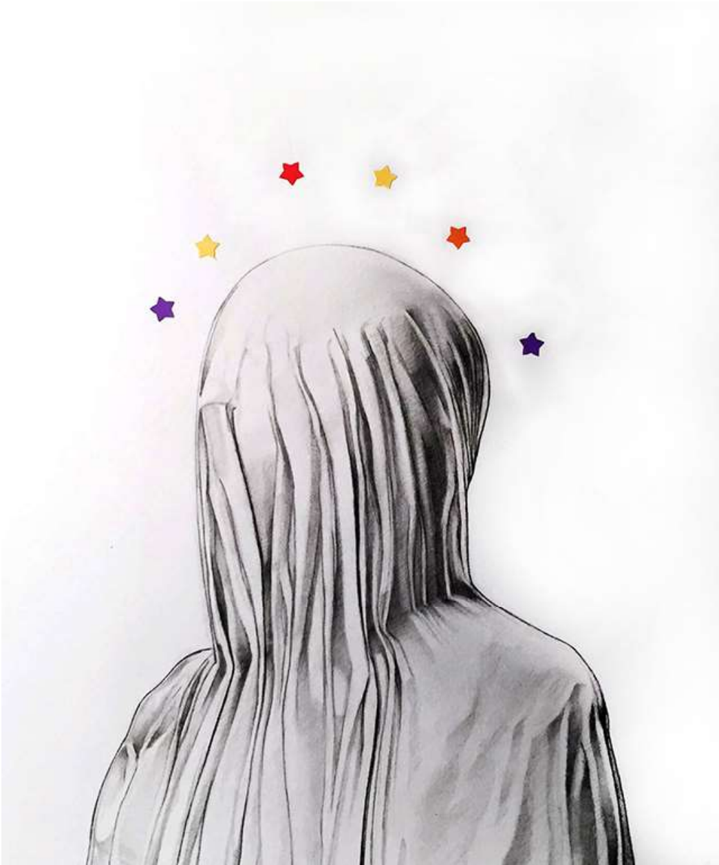
Nirodha. Graphite/mixed media.