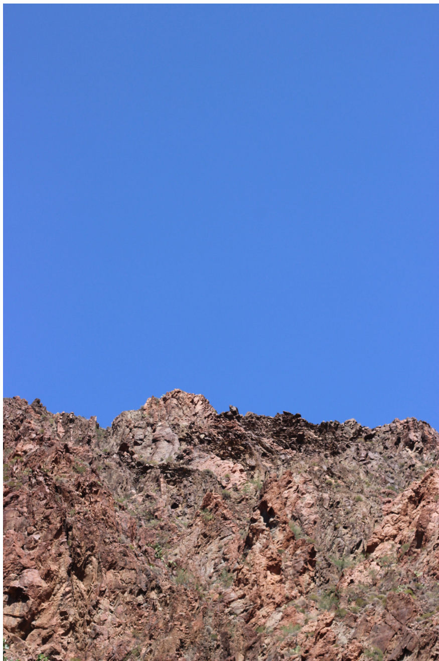
Contrast , archival inkjet print, 2016