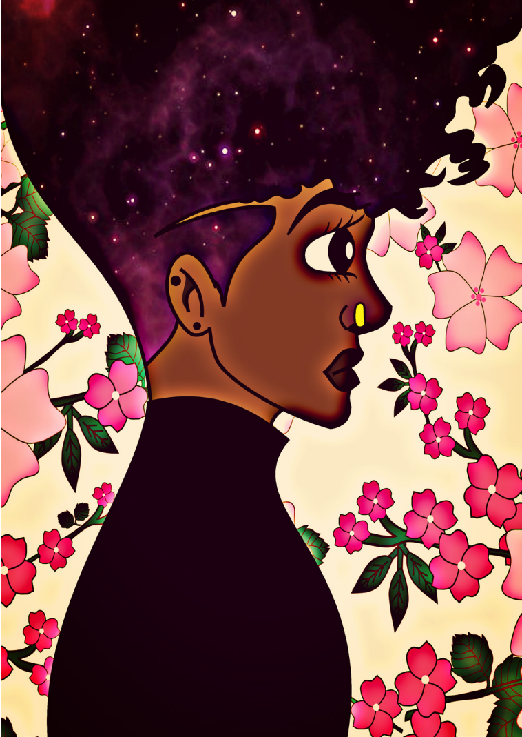
A Woman's Mind , digital art, 2017