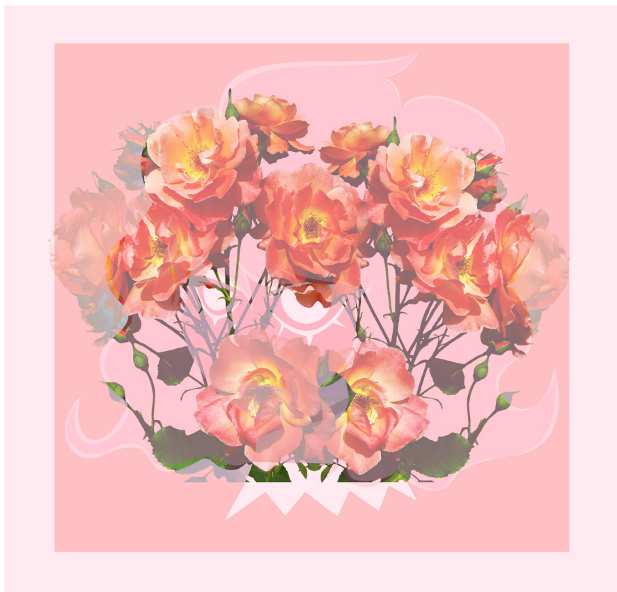
Calla's Lily , digital art, 2017