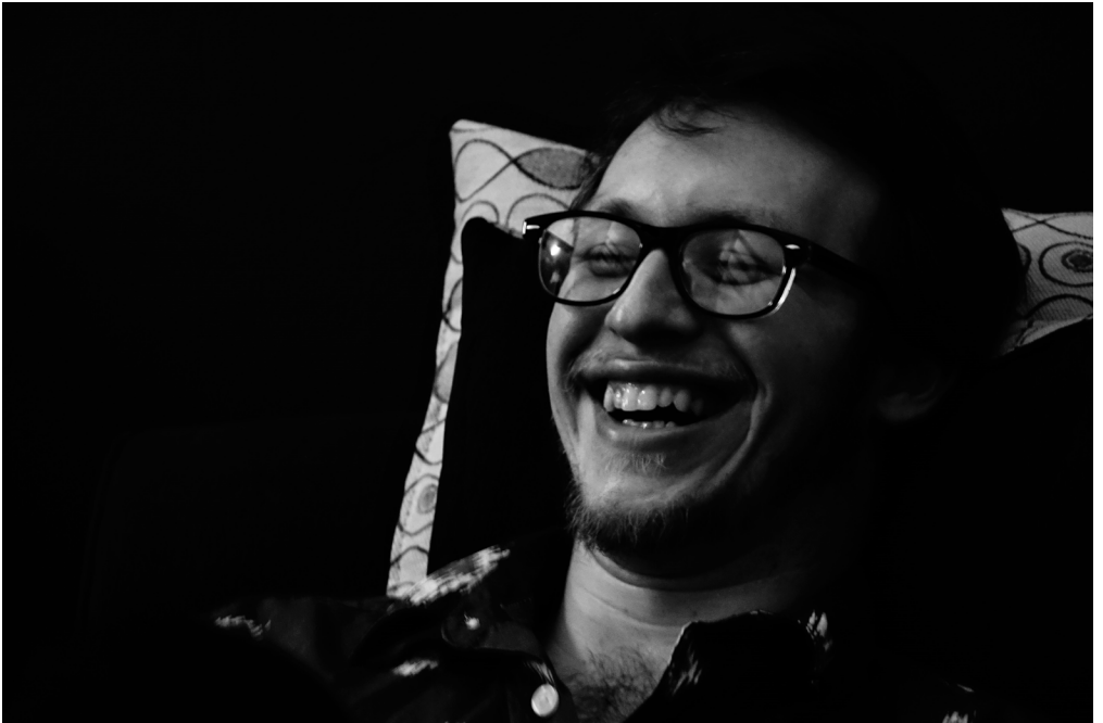
Hope This Isn't a Dream , photograph, 2018