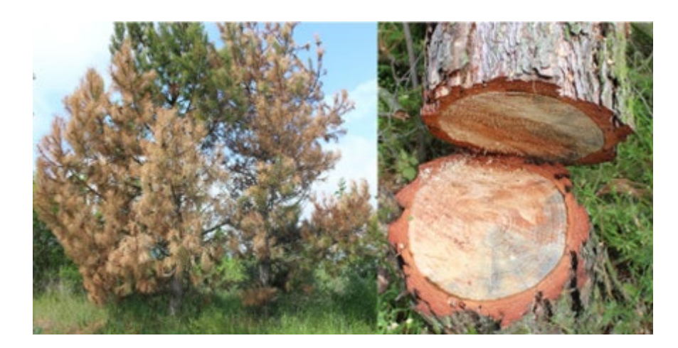
Figure 1. Pine wilt disease symptoms on a pine tree (left) and blue stain on cross section (right).

were brought to the Nematology lab of Trakya Agricultural Research Institute (TARI). Before nematode extract, morphological identification of insect species was performed and the specimens were sent for additional molecular analysis. Nematodes were extracted according to the EPPO PM 7/4(3) protocol (Anonymous, 2013). Each insect was cut into pieces and nematodes were extracted from the body of each insect for 24 hr by the modified Baermann funnel technique.