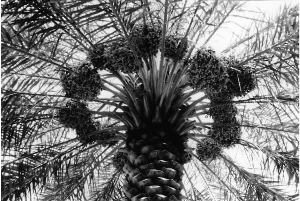
Fig. 2. Date palm tree with fruit bunches at peak production.