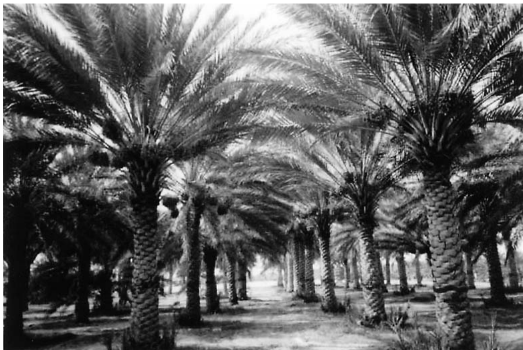
Fig. 1. A date palm plantation at fruiting stage located in the Interior region of Oman.

Mani et al. (1997) reported the presence of five root-lesion nematodes, Pratylenchus brachyurus , P. coffeae , P. delattrei , P. jordanensis , and P. neglectus from the rhizosphere soil of date palm in Batinah, Dhahira, Interior, Musandam, and Sharqia regions of Oman respectively. A nematological survey of date palms and other major crops in Algeria conducted by Lamberti et al. (1975) found three nematode species ( Pratylenchus penetrans , Xiphinema elongatum and Longidorus congoensis ) causing damage to date palm with the most common being X. elongatum , which was observed in all the oases studied. Greco et al. (1980) investigated the possible interaction between Fusarium oxysporum Schl. f. sp. albedinis , causal agent of bayoud disease of the date palm, and the root-knot nematode Meloidogyne incognita (Kofoid et White) Chit-