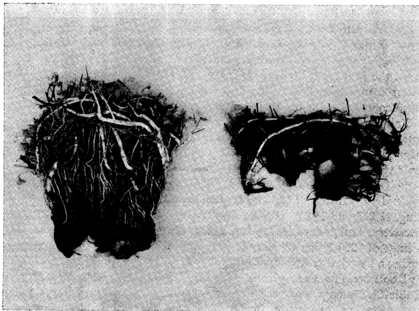
Fig. 1. Root injury caused by Pratylenchus scribneri on Mentha spicata . Left, uninfested; right, infested.