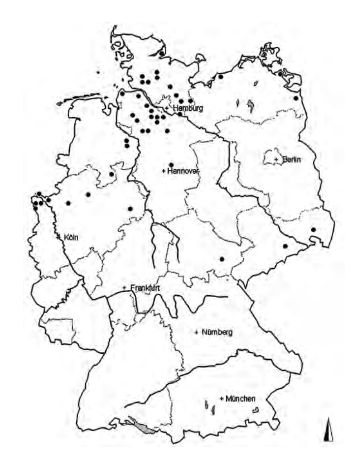
Fig. 2. Records of Hoplotylus femina in Germany.

In the Slovak Republic H. femina appears to be a rare nematode species, recovered at only one site (Mičakovce) in the north-eastern region of the country in the orographic unit Ondavská vrchovina upland, at an altitude of about 200 m, with average rainfalls of 700-800 mm and an average temperature of 7 °C. In Germany, H. femina was recovered in 1968 for the first time (Sturhan, 1969); since then the number of records has increased to the present total of 41. The distribution of the sites of occurrence is shown in Fig. 2, with the most northern record from a place near Eckernförde (Schleswig-Holstein), and the most southern near Pössneck (Thüringen), most of the records being from the northern lowlands and a few from medium elevations more in the south of the country. Despite intensive sampling in the more central and in the southern regions of the country, no H. femina could be found here. This interesting distribution can hardly be explained by differences in climatic or edaphic factors, or presence or absence of preferred biotopes or putative hosts. The most plausible interpretation appears to be that an invasion or post-glacial recolonisation of the more central parts of Europe took place, starting from south-east Europe through Romania, Slovak Republic, Czech Republic, Poland, eastern and northern Germany and extending to the Netherlands and Belgium in the west. Further records from other regions in Europe may support or