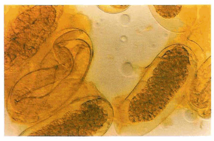
Fig. 1. Effect of saffron on the stain of nematodes: top, active unstained Pratylenchus ; middle, dead stained Meloidogyne ; bottom, egg shells not deeply stained compared to egg content (embryo).