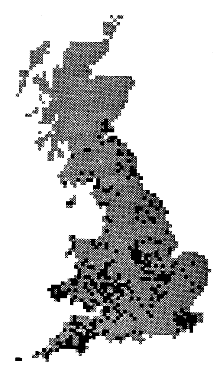
Fig. 3 - The geographical distribution of Xiphinema diversicaudatum in the United Kingdom displayed on a map produced by CAMAP, Edinburgh Regional Computing Centre, Edinburgh, Scotland.