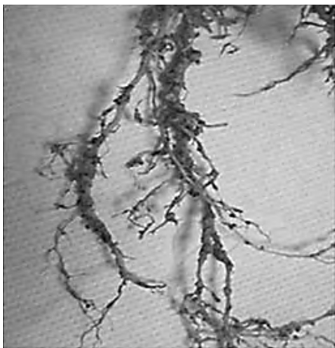
Fig. 2. Pepino ( Solanum muricatum ) roots infected with Meloidogyne spp.

Species-specific amplicons were obtained using a total of 25 \mu l of PCR reaction mixture with 2 units of Taq PCR Master Mix kit (Qiagen, Maryland, USA), 1.5 \mu l of 10 pM primers, 6.5 \mu l of PCR water (Sigma, St. Louis,