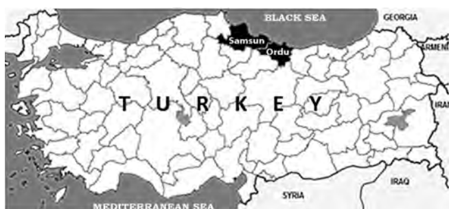
Fig. 1. Map of the provinces where pepino plant samples were collected in Turkey.

were loaded with the protein extract from test sample females. Electrophoresis was conducted in a discontinuous buffer system with 8% acrylamide running gel, pH 8.8 and 4% acrylamide stacking gel, pH 6.8. The voltage was maintained at 80 volts for the first 16 minutes and increased to 200 volts for the remainder of the running period. Following electrophoresis, the gels were removed and placed in an enzyme reaction mixture to determine esterase patterns (Harris and Hopkinson, 1976). The malate dehydrogenase isozyme was also determined but, unfortunately, the data are not available.