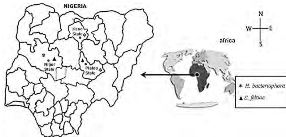
Fig. 1. Occurrence and distribution of entomopathogenic nematodes in Nigeria. * = Heterorhabditis bacteriophora ; ▲ = Steinernema feltiae .

were collected and thoroughly rinsed in distilled water and placed in modified White traps (Kaya and Stock, 1997). All emerging nematodes were collected from single dead larvae and considered as one isolate. After that, each nematode isolate was cultured on G. mellonella larvae to produce nematodes for identification and establishment of cultures. These nematodes were stored at 10 °C in tissue culture flasks containing distilled water.