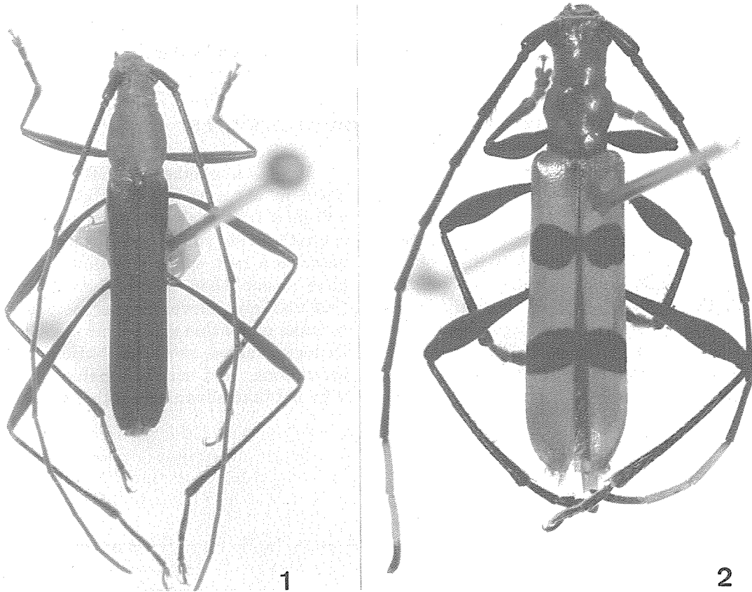
Figures 1 - 2. 1. Chariergus caeruleus , new species, holotype male; 2, C. paranaensis , new species, holotype male.