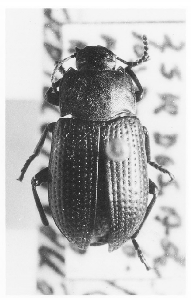
Figure 1. A) Opatrinus armasi n. sp. Paratype, female OHG - 1185, collected 2.5 km from San Antonio de los Baños, La Habana. B) Opatrinus pullus Sahlberg, female OHG - 1195, collected 2.5 km from San Antonio de los Baños, La Habana.

Antenna with hairs in each segment, gradually enlarged toward the terminal segment which is the widest; the second segment largest, the third segment a bit smaller, but longer than the rest.