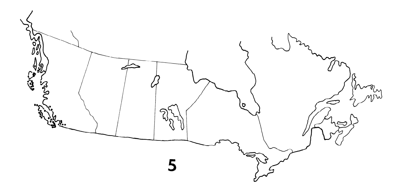
Figure 5. Distributions of S. sexspinosus, the family Cryptopidae, and the order Scolopendromorpha in Alaska and Canada.

distant for the chilopod to be probable for Canada. Consequently, S. rubiginosus is deleted from the Canadian and Alaskan fauna, leaving only one native scolopendromorph occurring north of the lower 48 states, S. sexspinosus.