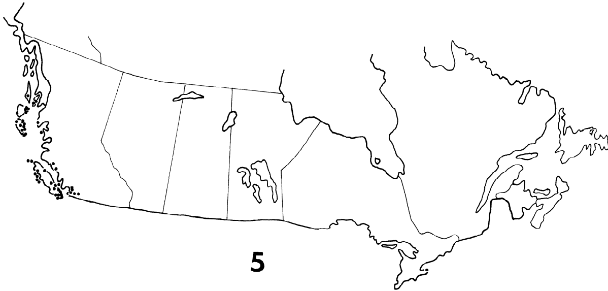
Figure 5. Distributions of S. sexspinosus , the family Cryptopidae, and the order Scolopendromorpha in Alaska and Canada.

distant for the chilopod to be probable for Canada. Consequently, S. rubiginosus is deleted from the Canadian and Alaskan fauna, leaving only one native scolopendromorph occurring north of the lower 48 states, S. sexspinosus .