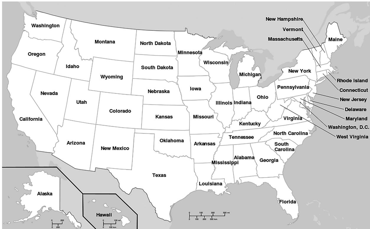
Figure 2. Map of the United States.