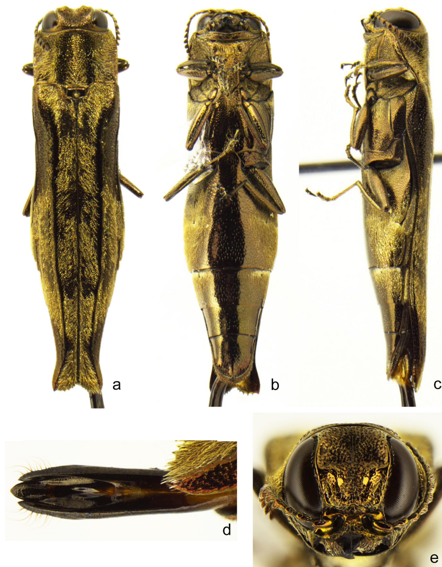
Figure 1. Agrilus langei Obenberger ♂. a) Dorsal view. b) Ventral view. c) Lateral view. d) Dorsal view of aedeagus. e) Frons.

Given the limited distribution of A. langei in the United States and the dearth of individuals observed in south Texas, it is reasonable to have concern about the elimination of habitat where A. langei is known to occur along the southern border. Abutilon trisulcatum was found in small patches by the author in multiple locations in Hidalgo and Cameron counties, but A. langei was observed only near Sabal Palm Sanctuary. As development continues to occur on land surrounding the few existing protected areas across the Lower Rio Grande Valley, the importance of preserving the shrinking habitat for native wildlife to thrive has become ever more pronounced.