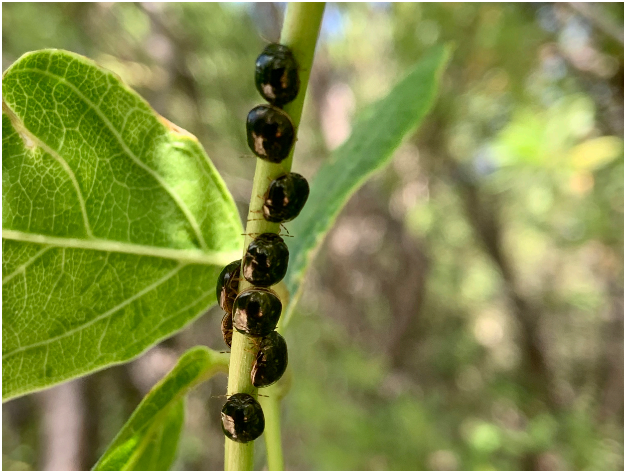
Figure 1. Brachyplatys subaeneus (Westwood) on Canavalia rosea (Sw.) DC. North Miami Beach, FL.

Following the confirmation of the species identification, a follow-up survey was conducted to determine the extent of the infestation in the immediate vicinity of the initial detection and to investigate the host status of C. uvifera . As B. subaeneus is known to have a strong preference for Fabaceae (Rédei 2016), plants in this family also were targeted. The initial infestation was located on the west side of a vegetated, low-lying sand dune which ran in a north-south direction. Brachyplatys subaeneus was observed on Canavalia rosea (Sw.) DC. (Fabaceae) (Fig. 1), and infestations on this plant appeared to be more numerous than the initial infestation on sea