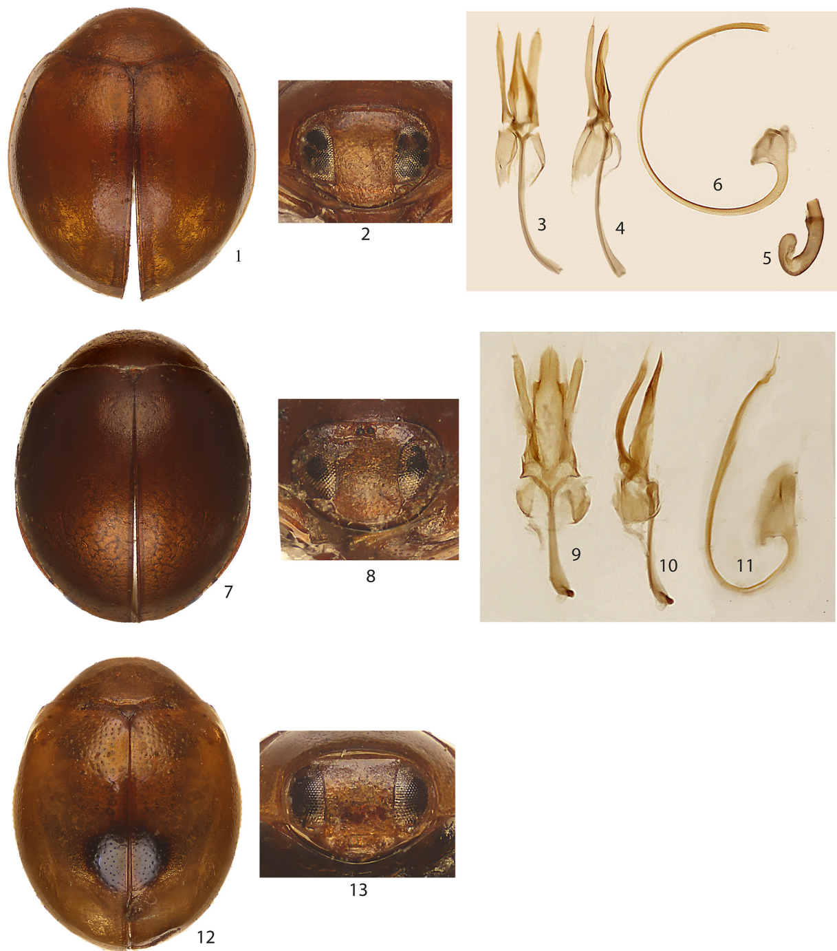
Figures 1–13. Calloeneis spp. 1–6) Calloeneis lynne . 1) Habitus. 2) Frons. 3) Penis guide ventral. 4) Penis guide lateral. 5) Penis. 6) Spermathecal capsule. 7–11) Calloeneis sheri . 7) Habitus. 8) Frons. 9) Penis guide ventral. 10) Penis guide lateral. 11) Penis. 12–13) Calloeneis marianne . 12) Habitus. 13) Frons.