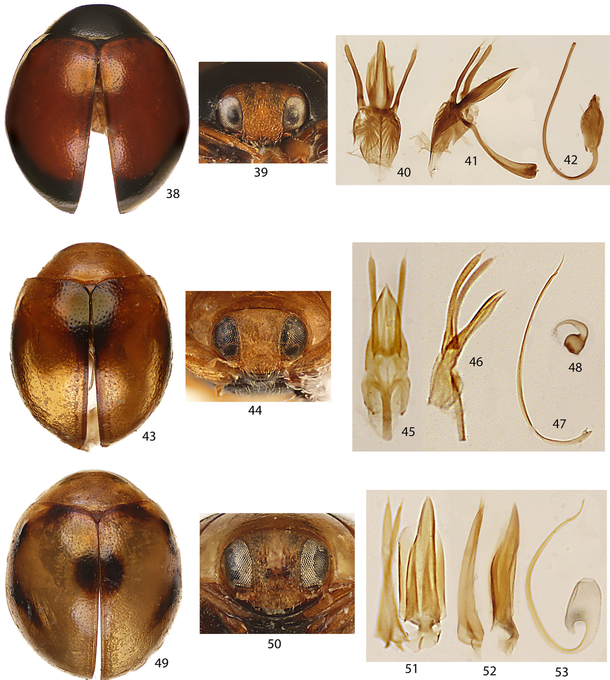
Figures 38–53. Calloeneis spp. 38–42) Calloeneis krista . 38) Habitus. 39) Frons. 40) Penis guide ventral. 41) Penis guide lateral. 42) Penis. 43–48) Calloeneis roxanne . 43) Habitus. 44) Frons. 45) Penis guide ventral. 46) Penis guide lateral. 47) Penis. 48) Spermathecal capsule. 49–53) Calloeneis angelica . 49) Habitus. 50) Frons. 51) Penis guide ventral. 52) Penis guide lateral. 53) Penis.