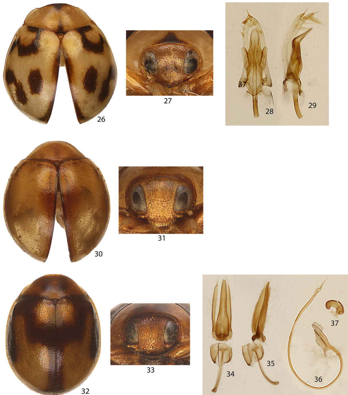
Figures 26–37. Calloeneis spp. 26–29) Calloeneis myra . 26) Habitus. 27) Frons. 28) Penis guide ventral. 29) Penis guide lateral. 30–31) Calloeneis leticia . 30) Habitus. 31) Frons. 32–37) Calloeneis signata . 32) Habitus. 33) Frons. 34) Penis guide ventral. 35) Penis guide lateral. 36) Penis. 37) Spermathecal capsule.