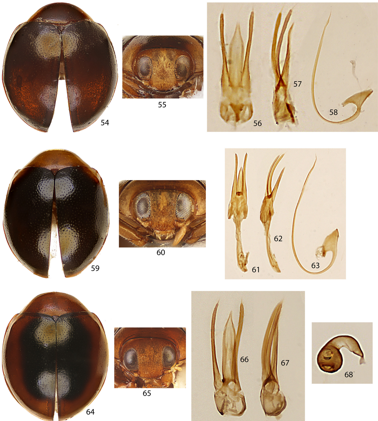
Figures 54–68. Calloeneis spp. 54–58) Calloeneis johnnie . 54) Habitus. 55) Frons. 56) Penis guide ventral. 57) Penis guide lateral. 58) Penis. 59–63) Calloeneis robyn . 59) Habitus. 60) Frons. 61) Penis guide ventral. 62) Penis guide lateral. 63) Penis. 64–68) Calloeneis francis . 64) Habitus. 65) Frons. 66) Penis guide ventral. 67) Penis guide lateral. 68) Spermathecal capsule.