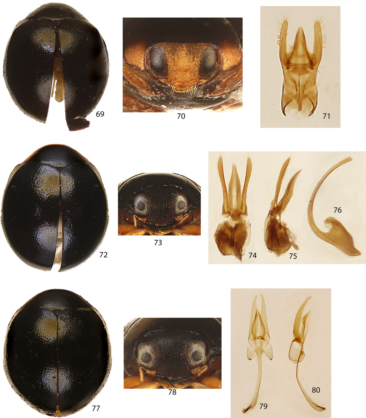
Figures 69–80. Calloeneis spp. 69–71) Calloeneis appropinquans . 69) Habitus. 70) Frons. 71) Penis guide ventral. 72–76) Calloeneis rosalie . 72) Habitus. 73) Frons. 74) Penis guide ventral. 75) Penis guide lateral. 76) Penis. 77–80) Calloeneis bennetti . 77) Habitus. 78) Frons. 79) Penis guide ventral. 80) Penis guide lateral.