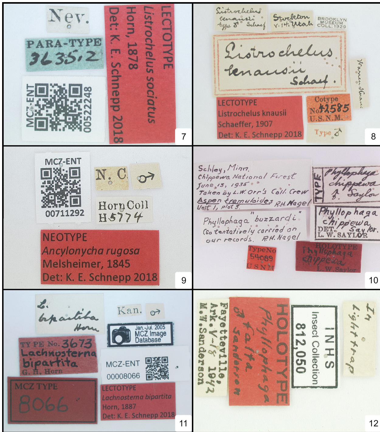
Figures 7–12. Specimen labels of Phyllophaga type specimens. 7) Phyllophaga sociata , lectotype. 8) Phyllophaga knausii , lectotype. 9) Phyllophaga rugosa , neotype. 10) Phyllophaga chippewa , holotype. 11) Phyllophaga bipartita , lectotype. 12) Phyllophaga falta , holotype.