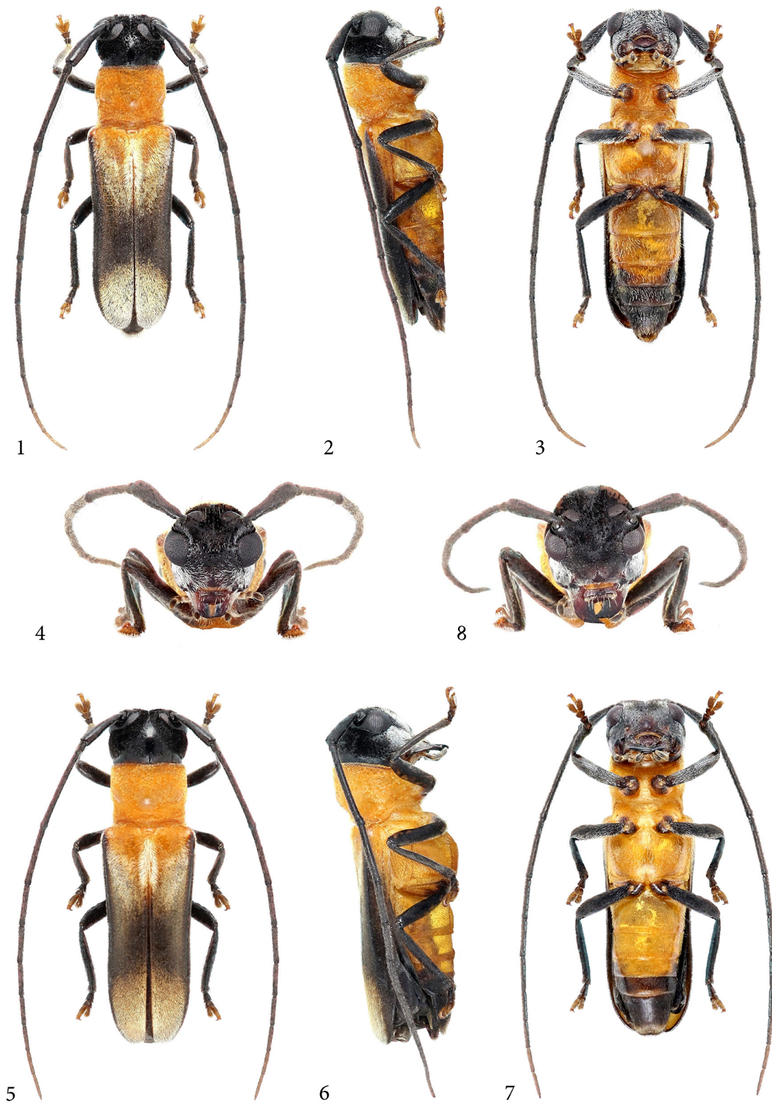
Figures 1–8. Olivensa sonzognii sp. nov. 1) Dorsal habitus, holotype male. 2) Ventral habitus, holotype male. 3) Lateral habitus, holotype male. 4) Head, frontal view, holotype male. 5) Dorsal habitus, paratype female. 6) Ventral habitus, paratype female. 7) Lateral habitus, paratype female. 8) Head, frontal view, paratype female.