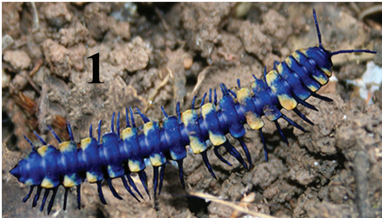
Figure 1. Tiphallus torreon , habitus photo showing in vivo dorsal coloration.

Color in life (Fig. 1). Dorsum and sides iridescent turquoise, lateral margins of collum and caudal paranotal corners on segments 2–18 with whitish areas varying from the tips and slight extensions along caudal margins on segments 6, 11, and 14, to large splotches covering caudal 2/3 to 3/4 of paranota on segments 5, 7, 9–10, 12–13, and 15–16. Epicranium medium turquoise, fading in interantennal and genal regions then darkening again on frons; labrum white. Pregonopodal sterna and prozonae dark to medium turquoise, fading on 7 th sternum between 9 th legs and only faintly blue thereafter. Legs