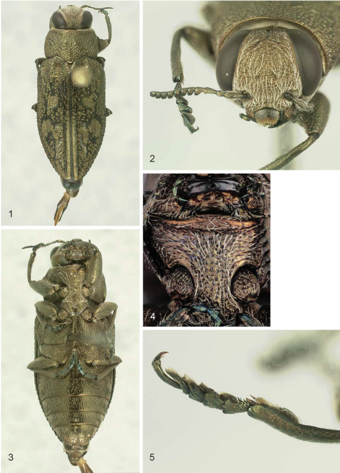
Figures 1–5. Chrysobothris cerceripraeda Westcott and Thomas, n. sp., male. 1) Dorsal habitus. 2) Front of head. 3) Ventral habitus. 4) Prosternum. 5) Protibia.