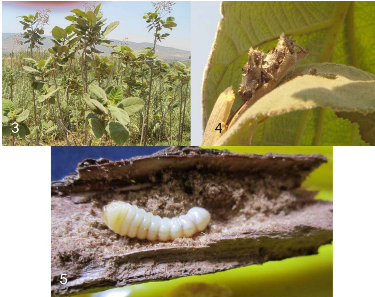
Figures 3-5. Wigandia urens (Ruiz and Pavón) H.B.K. with Desmiphora hirticollis . 3) Host plant. 4) Mating pair. 5) Larva in host stem.

Duffy, E. A. J. 1960. A monograph of the immature stages of Neotropical timber beetles (Cerambycidae). British Museum of Natural History; London. 327 p.