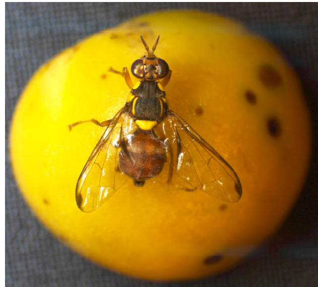
Figure 1. Adult female Bactrocera latifrons on a ripe turkeyberry, Solanum torvum , fruit, showing identifying features of clear wings with small widened black spot at tip and usually brown abdomen with no T-shaped black mark.