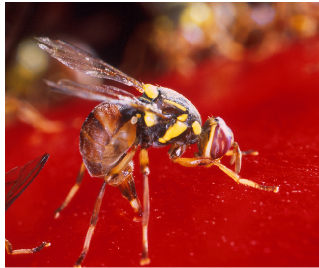
Figure 2. Adult female Bactrocera latifrons inserting ovipositor into ripe tomato, Solanum lycopersicum L., fruit.

The highest field infestation rates (number of B. latifrons individuals per kg fruit) are all reported in solanaceous fruits, the top five being Solanum lasiocarpum Dunal (823.3/kg; Clarke et al. [2001]), Solanum trilobatum L. (705.3/kg; Clarke et al. [2001]), Solanum nigrum L. (643.4/kg; Vargas and Nishida [1985a]), Solanum torvum Sw. (402.3/kg; Clarke et al. [2001]), and Lycianthes macrodon (397.8/kg; Clarke et al.