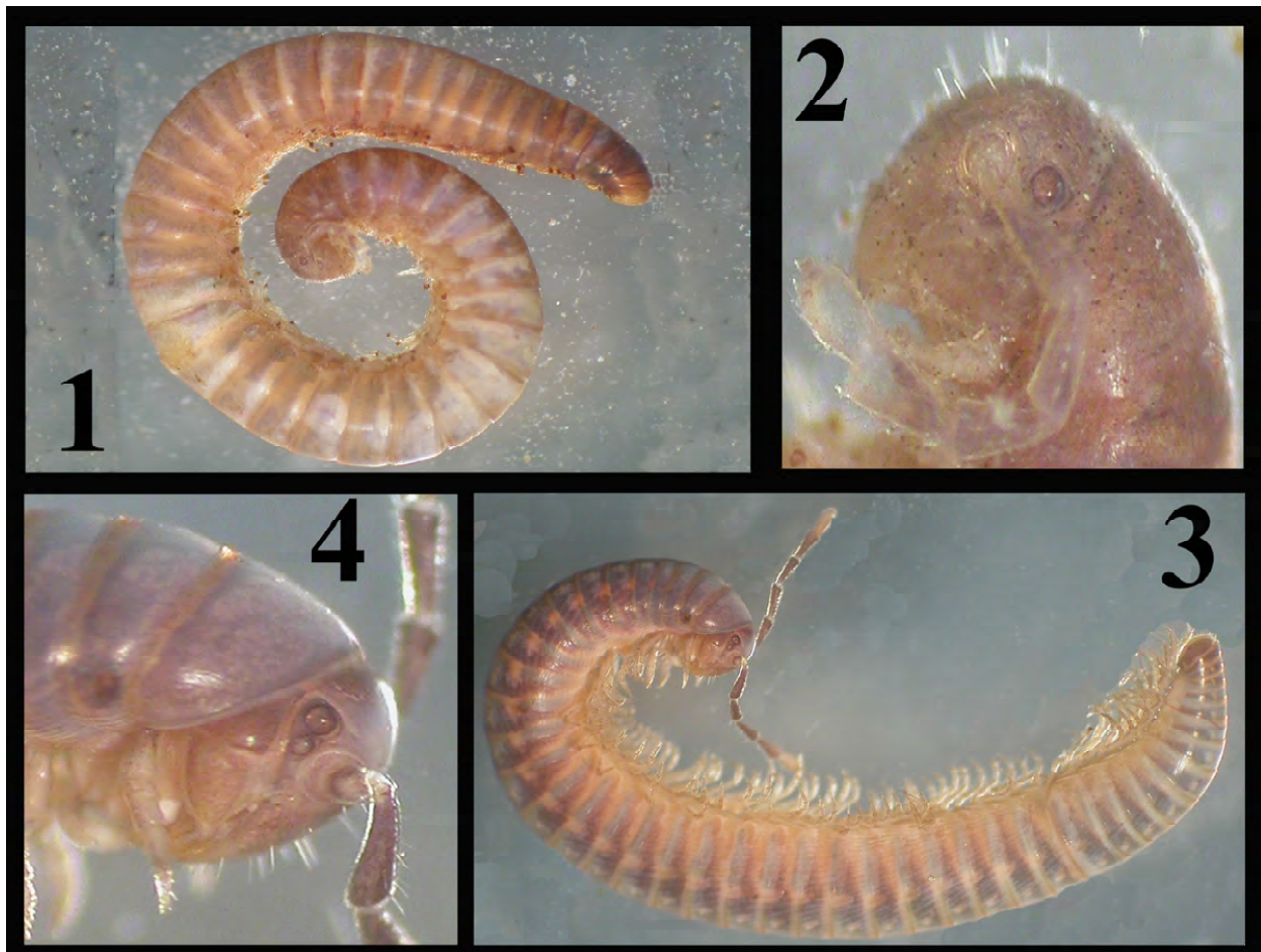
Figures 1-4. 1) Broward Co., Florida, stemmiulidan, depigmented after 20 years in preservative. 2) The same, close up of left ocellus. 3) Stemmium heatwolei (Vélez, 1967) from Arecibo, Puerto Rico. 4) the same, close up of right ocellus.