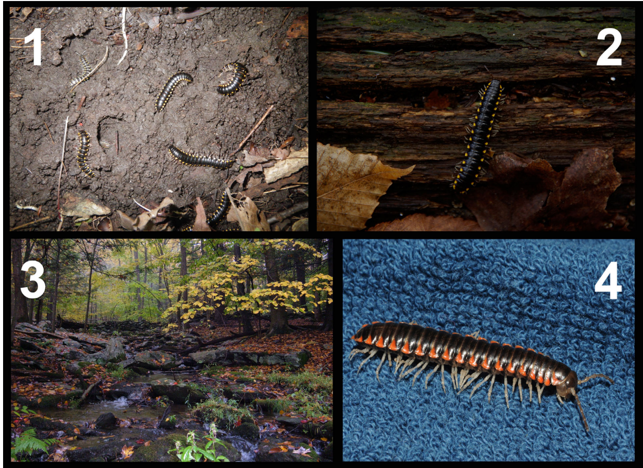
Figures 1-4. Boraria spp. 1) A cluster of B. stricta under leaves on saturated substrate at Mianus River Gorge Preserve, Westchester Co., New York. 2) An individual of B. stricta climbing a log at this site; note the juvenile in the depression left of center. 3) A tributary of the Mianus River in the Preserve showing leaf litter and the surrounding deciduous forest, an ideal environment for B. stricta . 4) B. infesta from Avon, Hartford Co., Connecticut.

rence in the Appalachian Plateaus Province (Allegheny Mountains) in southern West Virginia, only 9.6 km (6 mi) to the northwest (Fig. 12-13).