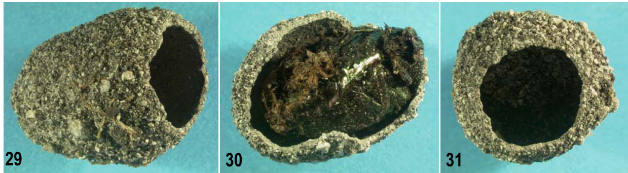
Figure 29-31. Cotinis aliena Woodruff, pupal cases. 29) Lateral view, empty. 30) Lateral view with beetle killed by fungus. 31) Caudal view.

Elytral carinae prominent, more elevated. Pygidium bicolored, basally green, with orange apical third. Scutellum barely exposed. Mesofemora ventrally punctate, covered with setae.