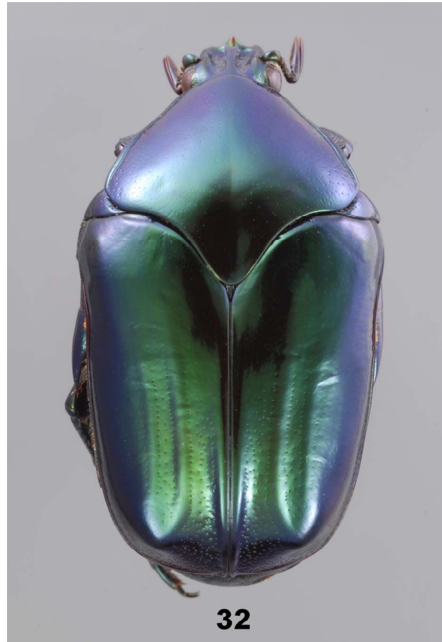
Figure 32. Cotinis viridicyanea (Perbosc). Specimen loaned and in private collection of M. A. Goodrich: “Yucatan, Mexico”.

Synonyms are indented under the valid species, and are based primarily on those established by Goodrich (1966) in the latest revision. The original designations of “var., ab., and subsp.” are retained here only for precision, but are not to be recognized as viable entities; they are now all considered junior synonyms as listed. Two patronymic species names of Gory and Percheron (1833) originally were not given Latin endings ( G. barthelemy and G. lebas ), but were subsequently emended. The Latinized spell-