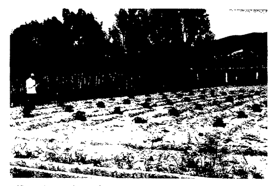
FIG. 1. Microplots at Tecamachalco, Mexico, on day of harvest showing the experimental design and type of container used.

er (pH 7.2) and applied at the desired concentration to the soil around the plant roots. The soil was irrigated to incorporate the lectins as specified in the description of each experiment. At Amherst the same amount of 10 mM Tris buffer (pH 7.2) was applied to the untreated controls and to the lectin treatments. Aldicarb treatments were concurrent with those of the lectins. Hatched second-stage juveniles in tap water were added to the soil 24 hours after application of lectins or aldicarb.